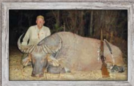
Central African Savannah Buffalo