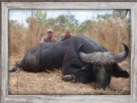
Eastern Savannah Buffalo