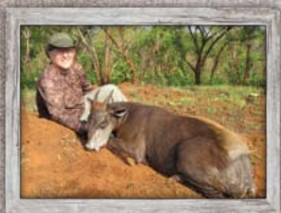
Yellow Back Duiker