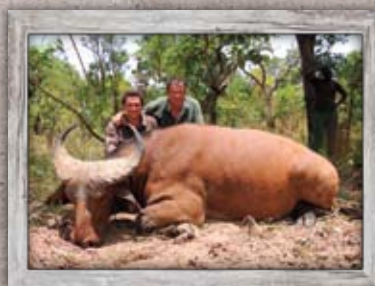
Western Savannah Buffalo