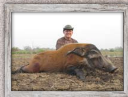
Red River Hog