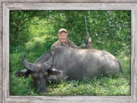
Dwarf Forest Buffalo