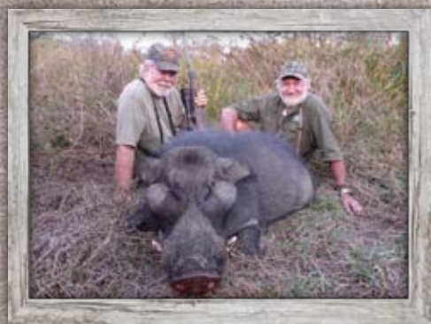
Giant Forest Hog